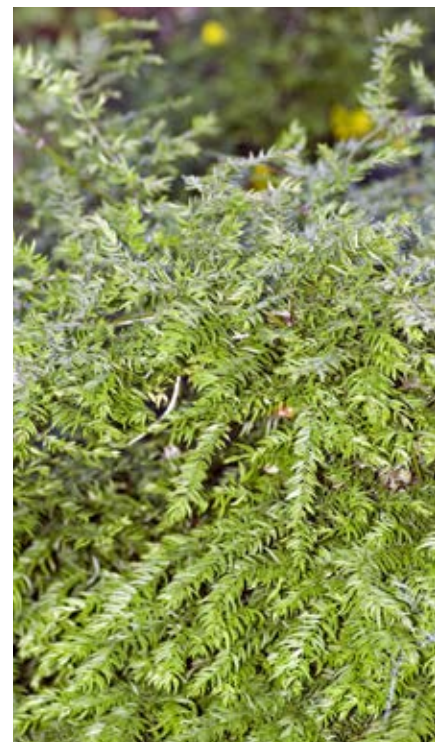
Asparagus scandens has the potential to become a serious problem in the reserve where it could smother seedlings and understorey plants.