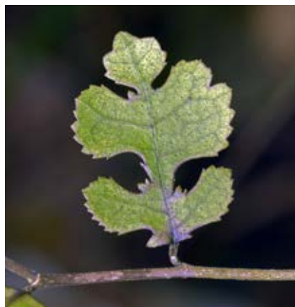
Streblus heterophyllus .

Other plants of interest were: Hebe parviflora , Streblus heterophyllus / tūrepo, Polystichum oculatum , and the greenhood orchid Diplodinium alobulum on clay banks.