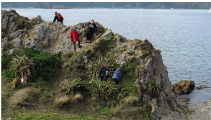
BotSoccers explore a rock stack on Miramar Peninsula.

Miramar Peninsula had several botanical surprises for BotSoccers and representatives of the Port Nicholson Trust alike on this beautiful, calm, winter's day. The mild weather, an easterly with rare drizzle, meant we could explore the coastal cliffs and rock stacks without having to use both hands to cling on with, as is often the case on this exposed coastline. Following a 1 April 2011 BotSoc trip to Breaker Bay and Oruaiti Reserve / Point Dorset, we began with a brief excursion along the Seatoun Beach end of Oruaiti Reserve. This brought home to us how few naturally occurring plants and species exist at this popular recreation spot. Moving