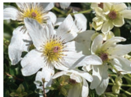
Clematis paniculata male flowers.