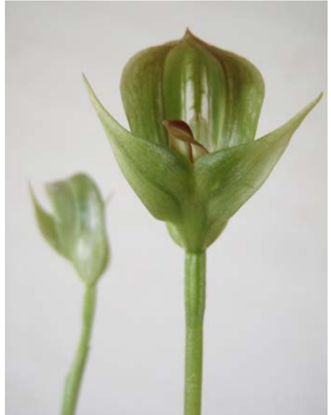
Pterostylis curta from the collection of the late Arnold Dench.

We will display various orchids that are in flower from his collection on Open Day, and Carlos Lehnebach can tell you all about them. See you all on 14 September.