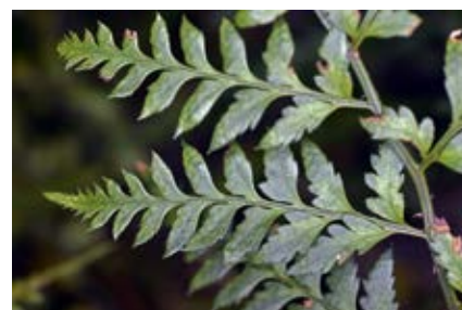
Polystichum oculatum .

We were concerned by the establishment of wilding native plant species not native to the Wellington area. We saw small-sized karaka trees surrounded by prodigious numbers of seedlings, epiphytic pōhutukawa (unc), Pittosporum ralphii , seedling pūriri (unc), and Pomaderris apetala / tainui (unc).