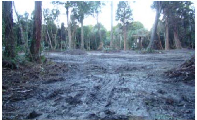
Aftermath of illegal clearing of forest.

Fast forward to 2010, when the lessee of Pounawea Camping Ground in the reserve, without consent, illegally felled part of the forest, uprooting ancient trees wreathed with severed, wrist-thick lianes, to gain increased revenue from campers’ fees. What had been a beautiful forest glade now looked like a war zone, with whole trees, root plates and huge limbs strewn in piles. This extraordinary act of vandalism received a ‘slap-on-the-wrist’ response from Clutha District Council (CDC) - the lessee was fined a paltry sum, required to clear the wreckage, and plant some replacements.