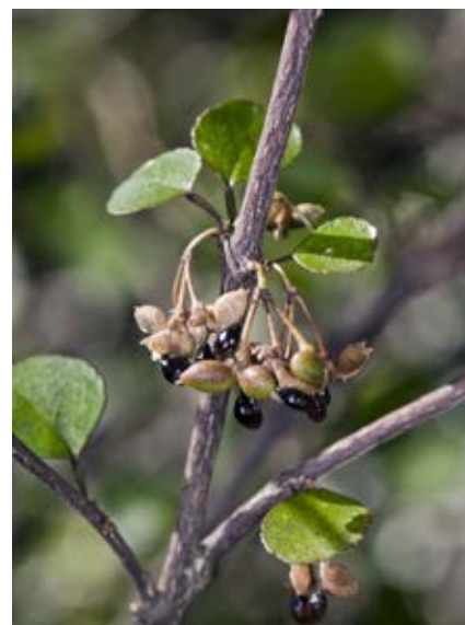
Melicope simplex.

After the break, we headed down to the stony river flats where the group splintered into sub-groups, making it hard to keep track of what was going on. I followed the pack on the river flats, while the sensible group stayed on the original river terrace, while others presumably headed home, unsure of where anyone was. The river-flats pack emerged back on the river terrace where there was a refreshing patch of beech forest. From there it was the final leg down to where the Whakatikei River meets the Hutt River. One of the last finds was a small Carmichaelia odorata on the bank of the Whakatikei. On the way back we went down a side track towards the Hutt River, walking through a rocky chasm, probably created by movement on the nearby Wellington Fault that runs near the western bank of the Hutt River. I found the geology of the terraces fascinating, walking along part of the zone in which tectonic movements have shaped the Wellington region for