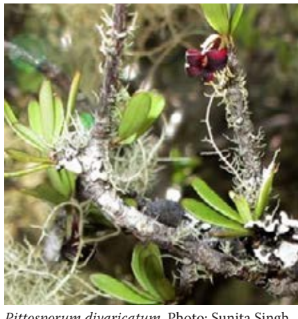
Pittosporum divaricatum.

way to flowering maturity. As luck would have it, the most successful was right behind the house on a small sapling beech which itself succumbed last season after the mistletoe had a bumper flowering season and overtaxed the host completely. The BotSoc party unfortunately pre-empted the main flowering season this year, but a few red flowers on the day indicated the scale of the glory that was to come. A highlight was the visit of a tūī, seen