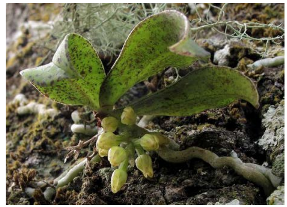
Drymoanthus flavus.

impatiently tweaking some of the early blooms. The party enjoyed a glorious day, working their way to the summit of the ridge for lunch, then along the ridge to join the Muritai Park Track back to Eastbourne. Several of the plants on the list prepared by Pat Enright for the covenant were in flower, ranging from the tiny nearblack Pittosporum divaricatum, to broad sprays of white Olearia rani which is almost in mast-year mode. Orchids, twenty of which are recorded for the covenant, needed a careful search. Both species of Drymoanthus were in flower, some Pterostylus banksii still with flower heads, with Gastrodia cunninghami beginning to rise from the earth. Apart from the tūī, the birdlife encountered included rifleman, fantail, grey warbler and kererū. Pest trapping was noted along the tracks in the covenant, with continuously set Timms traps for possums (10), and peanut-butterbaited Victor rat traps in tunnels (34) which kill mice, rats, stoats, weasels, and small hedgehogs, allowing annual assessment of numbers to be kept. This season, despite a massive beech mast year in November 2013, the numbers of rodents was kept to a minimum throughout the winter by the combined effort of GWRC