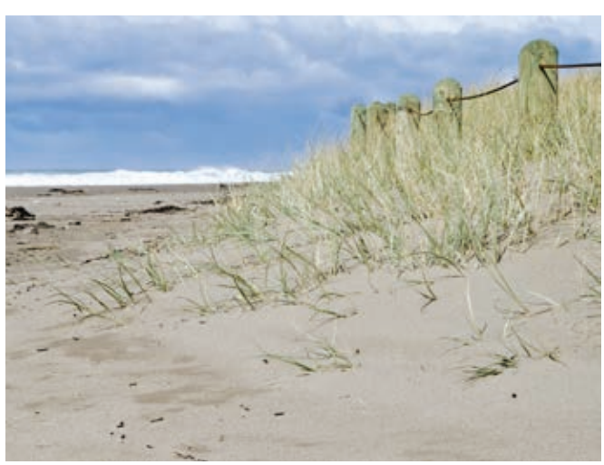
Spinifex planted at Riversdale Beach.