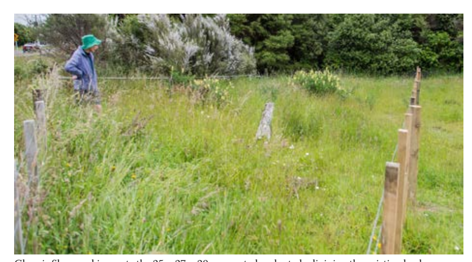
Glennis Sheppard inspects the 25 \times 27 \times 29 m area to be planted adjoining the existing bush.

Nine people attended this weeding workbee on an extremely wet morning. Priority for first-comers was to check the main (original) Bush, which was generally weed-free, except for two small patches of tradescantia, so we concentrated on the southern extension, where the most recent plantings needed releasing from rank grasses. Next, we moved to the east side, near the solitary kahikatea, which is usually a rubbishy area, and always infested with montbretia. This kahikatea, a female, produces a prodigious amount of seed, despite (or because of) serious damage in the snowstorm of 2011. Its seedlings make a welcome addition to F&B's nursery, for planting in local forest remnants We note that tawa seedlings are more common now in TMBsome almost a metre tall. Despite a droughty period earlier in Spring, tiny black maire and tōtara seedlings were also plentiful, and generally the Bush looked in good condition. We did