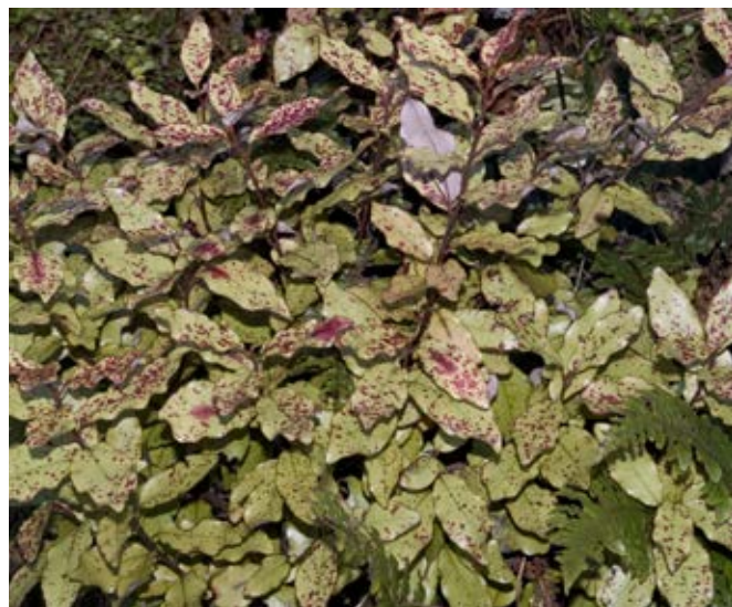
Horopito / Pseudowintera colorata.