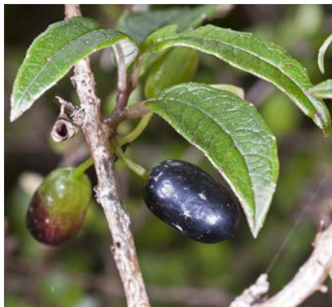
Kōnini, the fruit of kōtukutuku / Fuchsia excorticata .

One of his favourite native berries is kōnini, borne on kōtukutuku / Fuchsia excorticata . This NZ endemic species is the world's tallest fuchsia. The colourful flowers give way to purple, juicy berries in summer/autumn. Traditionally they were made into a juice. They are popular with bellbirds / korimako and tūi, so if planted in the garden, they attract these birds. Other edible native tree berries include tawa, miro and kahikatea.