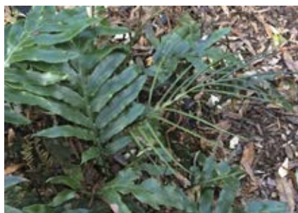
Blechnum colensoi .

The Pauliks turned off the electric fence so that we could descend into the gully. Once in there, we were first impressed by the abundance of Blechnum colensoi / waterfall fern / peretao, some with fish-skeleton-like fertile fronds.