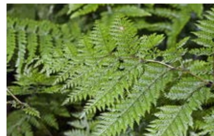
Leptolepia novae-zelandiae .