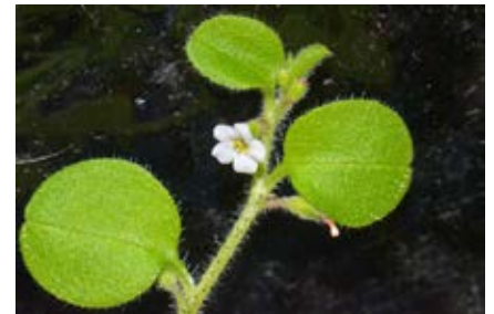
Myosotis spathulata .

We spent 3.5 hours botanising the low level Tōtara Loop track. There are some very good examples of tōtara, with plenty of rewarewa and matai. More exciting was the tiny Myosotis spathulata that Pat pointed out, and Fuchsia perscandens which is common on the lower track, but uncommon in Wairarapa. We added Corynocarpus laevigatus , Hymenophyllum sanguinolentum and Metrosideros perforata to the substantial plant list of the forest area.