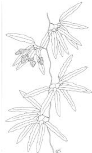
Lygodium articulatum . Illustration: Eleanor Burton.

Eager and fresh, we all botanised a nearby bush circuit. The excellent flights of boxed steps down the Sheep Track made for easy viewing. Highlights were the orchids, the star being Orthoceras novae-zealandiae . We compared Lycopodium deuterodensum and L. cernuum side by side. We saw Astelia trinervia , new to many of us, and the fern, Lygodium articulatum , hanging through the lower canopy of predominantly tanekaha / Phyllocladus trichomanoides .