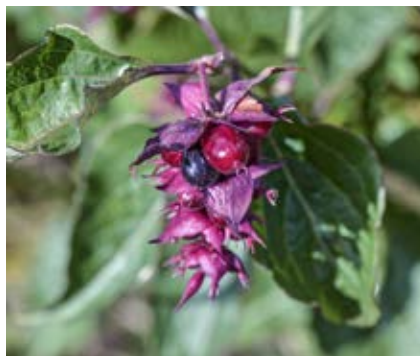
Sambucus nigra (top), Leycesteria formosa .