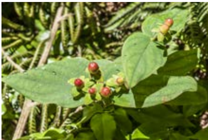
Hypericum androsaemum .