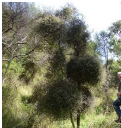
Streblus heterophyllus .

Amongst many other rush species it may be easily overlooked. Several species of rushes and sedges gave us the opportunity to learn a few more. There was much discussion about a bunch of Carex which were identified as Carex testacea , C. raoulii and/or C. "raotest" . Pat has now confirmed them as all C. "raotest" which differs from C. raoulii by all its terminal spikelets being male. The bush in this block is relatively diverse, considering its grazing history. Of note was a wonderfully shaped Streblus heterophyllus near the head of the gully, numerous Pseudopanax crassifolius , and Clematis forsteri in seed. The two C. vitalba / old man's beard plants found were pulled out by Gavin, Sunita and Eleanor.